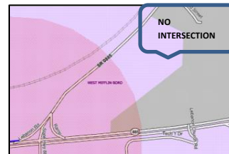
Member Notification Area map