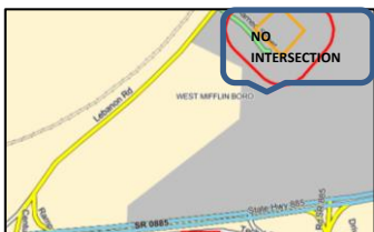
Ticket Notification Area map

In example 2, because the sites do NOT intersect, the ticket will NOT transmit.