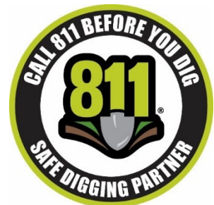
Safe Digging Partner